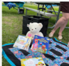
Teddy Bear Picnic at Patriarche Park