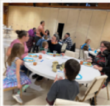
Havdallah Movie Night

If you would like to learn more about PJ Library visit pjlibrary.org . If you have any questions please email wrenyk@aol.com