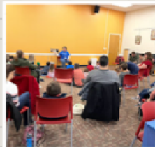
PJ Library Chanukah program with the East Lansing Library